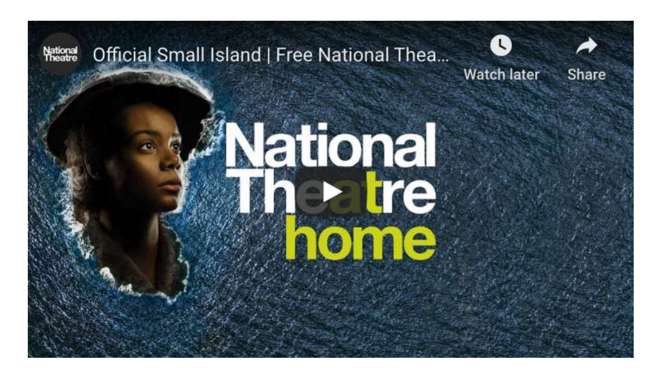
Small Island 2 hours 55 minutes