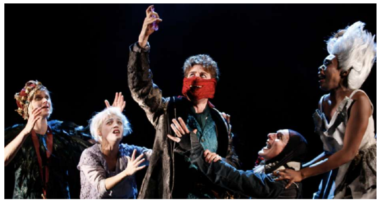
The Grinning Man A Musical (from Bristol Old Vic) Approximately 2 hours in duration Trailer here